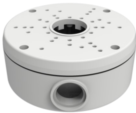
Junction Box IBBWM-134