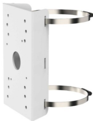
Pole Bracket IBBCPM