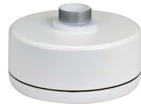
Junction Box IBBCEM-134