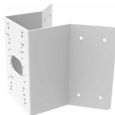
Corner Bracket IBCRWM