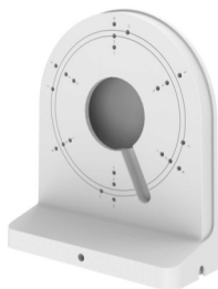
L Bracket IBDLWM-2